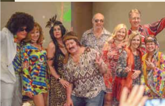
Guests sported their 70s attire or posed in the 70s cutout for a memorable photo.