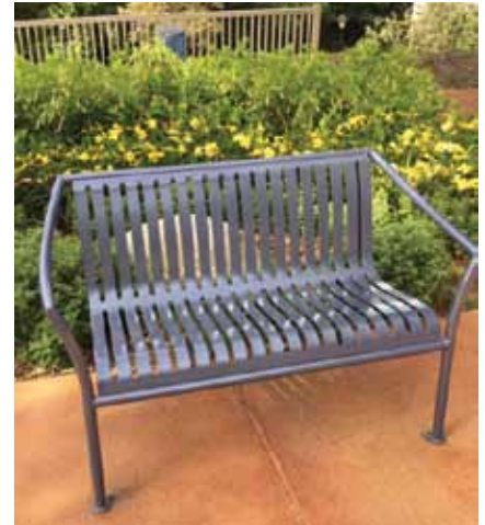
Town Square benches are the chosen style for campus benches.

Benches and landscaping trees in designated locations throughout the campus offer special commemorative opportunities. Donor gifts provide for the tree or bench, installation and a plaque. Donors may choose from a list of more than 20 available bench locations and 12 available trees and their locations.